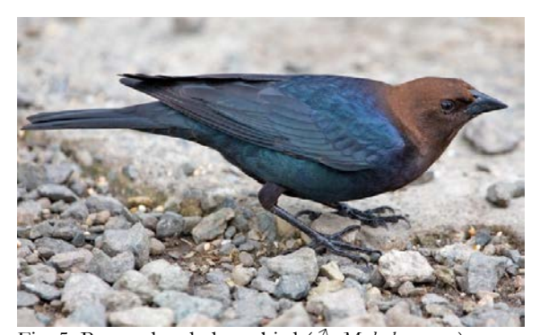
Fig. 5. Brown-headed cowbird (3; Molothrus ater)