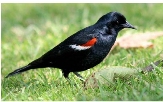
Fig. 2. Tricolored blackbird (3; A. tricolor)