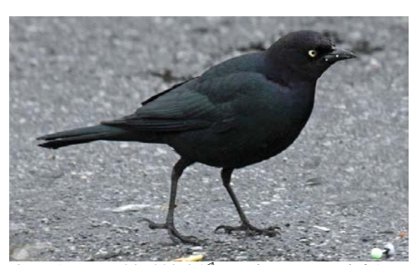
Fig. 4. Brewer's blackbird (3; Euphagus cyanocephalus)