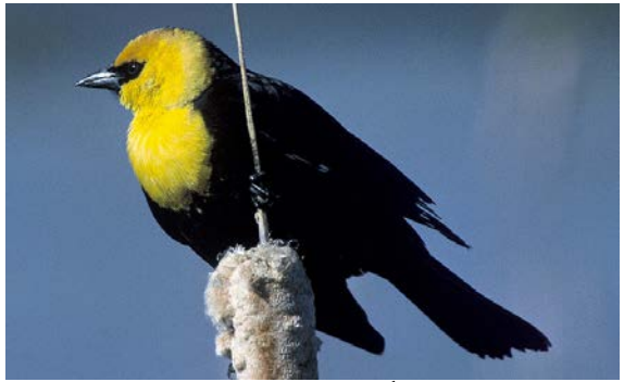
Fig. 3. Yellow-headed blackbird (&; Xanthocephalus xanthocephalus)