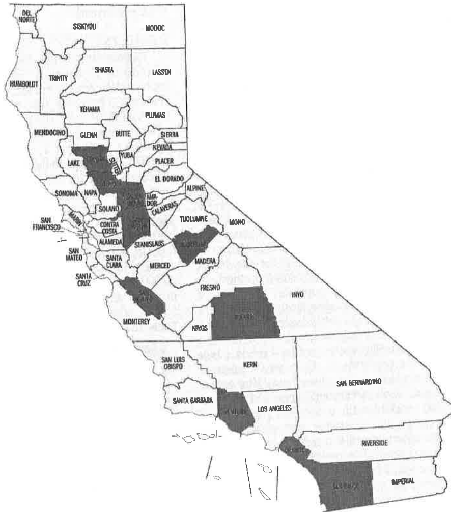
Figure 1. California counties containing research plots.

We compiled information from the current ground squirrel Best Management Practices project (Salmon et al. 2003), and previous anticoagulant studies (Salmon et al. 2002) to create project manuals and multimedia presentations for use in training cooperators. The project manual distributed to cooperators included a summary of ground squirrel ecology and control methods. Cooperators were trained in rodenticide safety, endangered species concerns, selecting research sites, mapping research plots, conducting bait acceptance tests, surveying squirrel populations, treating sites with anticoagulant baits, carcass searching and disposal, and collecting and compiling data. The project workbooks were collected upon completion of the study.