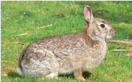
Fig. 3. Brush rabbit ( S. bachmani )