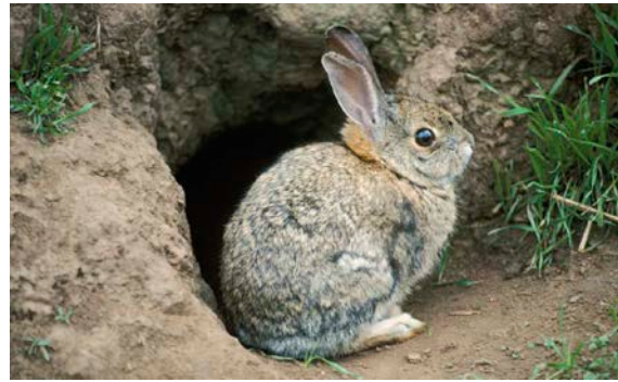
Fig. 2. Desert cottontail rabbit ( Sylvilagus audubonii )