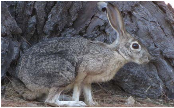
Fig. 1. Black-tailed jackrabbit ( Lepus californicus )