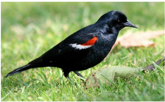
Fig. 2. Tricolored blackbird (3; A. tricolor)