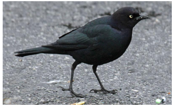
Fig. 4. Brewer's blackbird (3; Euphagus cyanocephalus)