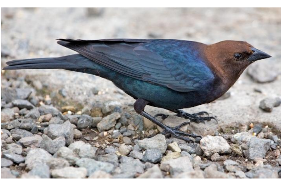
Fig. 5. Brown-headed cowbird (d'; Molothrus ater)