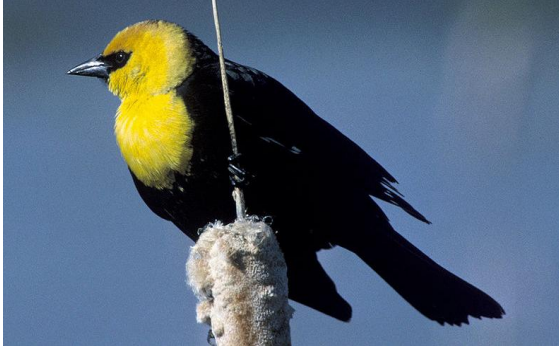
Fig. 3. Yellow-headed blackbird ( C ; Xanthocephalus xanthocephalus )